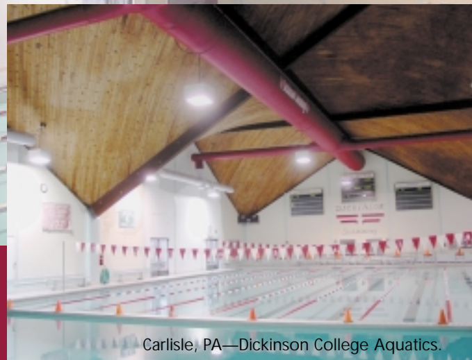
Carlisle, PA—Dickinson College Aquatics.